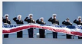
PROVIDING WARSHIPS READY FOR COMBAT