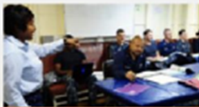
DEVELOPING OUR SAILORS