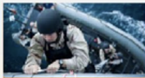
TRAINING OUR CREWS TO FIGHT AND WIN